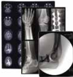
BLUE & CLEAR FILM 14"x17", 11"x14", 8"x10"